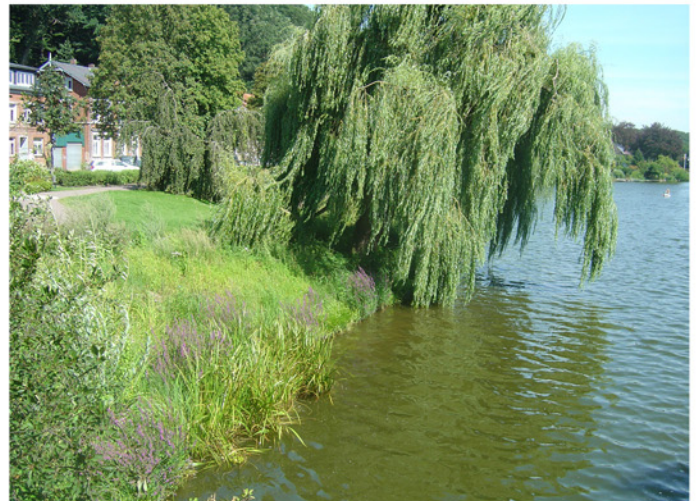
The situation has completely changed within a few month: Animals are enabled to move from land to water. Wildlife habitat has been created, and to add to the physical attraction of the site flowering species including purple loosestrife have been chosen for the plant carpets.