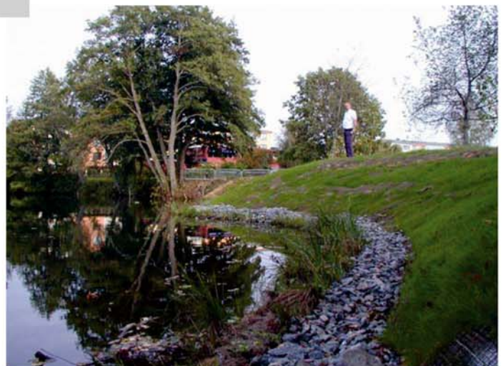
One week after installation