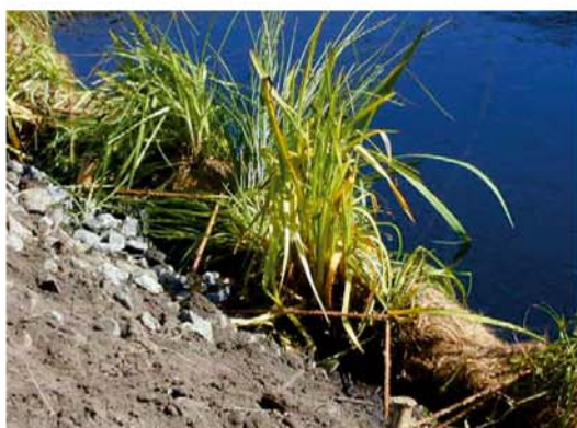
Pre-planted coir rolls